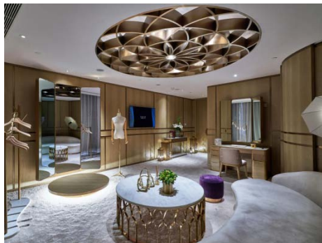
K11 Guangzhou Clubhouse & Convention center