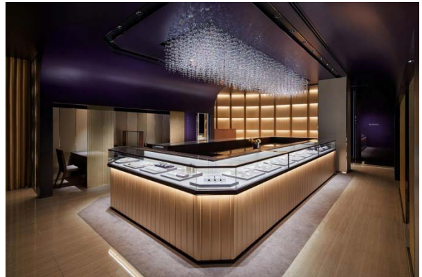
NIWAKA Ginza store