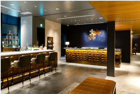
The Royal Park Canvas – Ginza 8